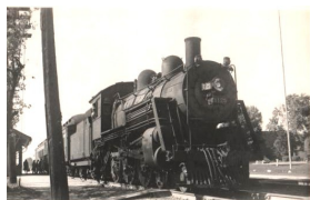
See page 3

VOLUNTEERS: We are always looking for people who are interested in helping preserve the history of our village and the surrounding area. Do you enjoy working on displays, gathering historical evidence, researching photographs or just putting around cutting news articles for our archives? We can also use people who are handy with tools to do miscellaneous repairs and modifications or, assist with building displays, floats, etc. There are no fixed hours and your compensation is the good feeling you get when you have helped us complete an important project. Please call us at 630-351-5300.