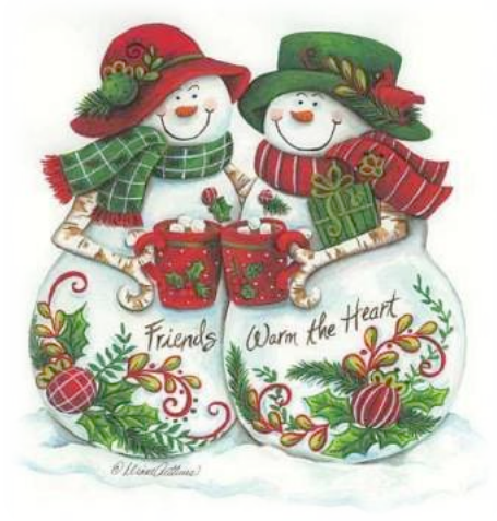
Sunday, December 2, from 2 to 4 p.m. Sumner House Museum, 102 S. Prospect Street

GUESS WHO'S COMING TO OPEN HOUSE? Right! Lots of snowmen—in the form of cookies and other treats. They'll be among the holiday decorations that will warm the spirit as will the subtle music in the background. Both buildings—the Sumner House Museum and the Richter House—will be open for tours. See how a home may have looked in the 1920s at Christmastime. Don't miss the table setting in the dining room.