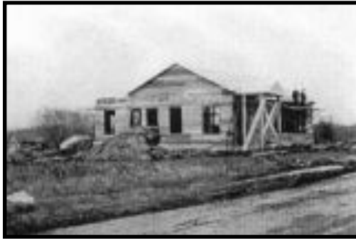
As early as 1939, when the area of Pine Street, Hill Street and Maple Avenue was plotted into lots, the Joliet Diocese began purchasing lots to build St. Walter Church. Construction on the first church began in 1947 in an undeveloped area of west Pine Street.