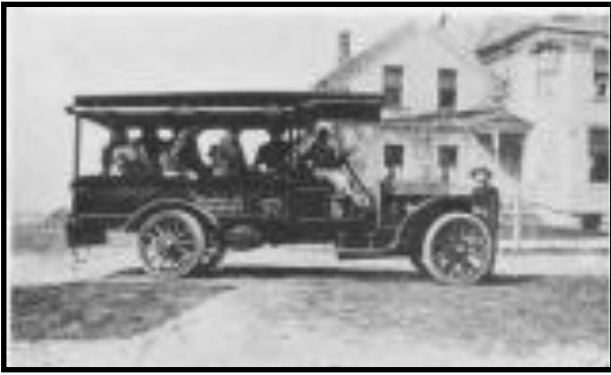
Botterman's Roselle Market replaced their horse and wagon with this modern delivery truck in 1910, shown here in front of the Bokelman and Troyke houses on east Irving Park Road. (Chicago Street in 1910).

Roselle Fire Department was formed in 1905. The fire equipment was housed in a village barn on the northeast corner of Irving Park Road and Roselle Road. The fire bell hung in a metal framework outside.